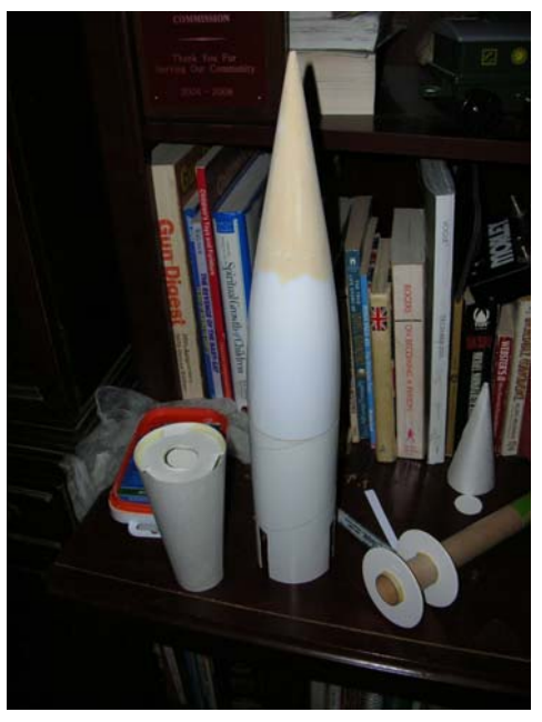
The pre-assembled main parts of the

At this point I quit and never went back to the project.... Not really, but if I'm going to get anything else in the newsletter, I need to cut it off here. In the next issue we will deal with such terrifying sub-