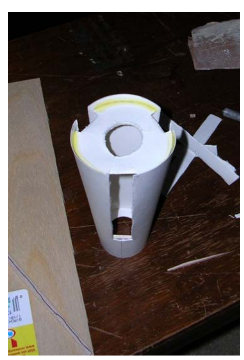
Slots cut in the tail cone.

The next step involved cutting slots for the landing gear in the tail cone and lower body tube. The Moonliner was displayed with its landing gear deployed, and I knew that the gear would be the only thing that could act as fins (short of putting clear plastic on the model -- which I hate to do). The issue this fact brought up was that there were slots, struts, and sliding gear workings that needed to be modeled. All of this stuff took some thought.