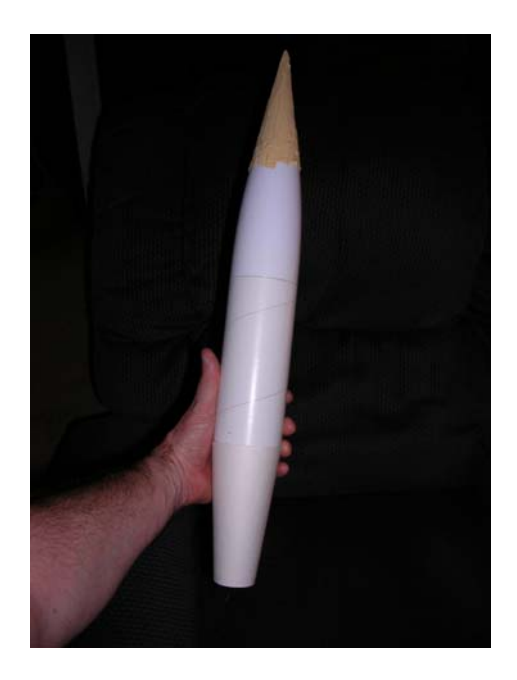
She is pretty much just nose and tail cone...

I then focused on the nose cone again. The Moonliner has a distinctive cockpit on the nose. I