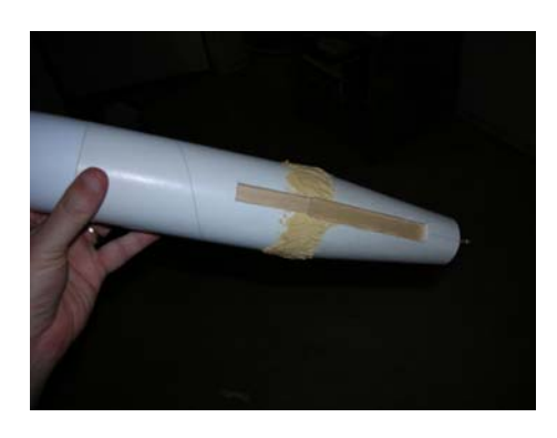
The pre-sanded completed body tube / tail cone.

pretty well. I then glued a 3/16 inch diameter launch lug to the main body tube.