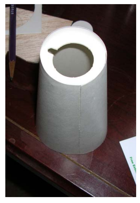
The basic tail cone assembly.

Next, I cut my body tube to length. I was a little concerned that it came out quite short. It seems that