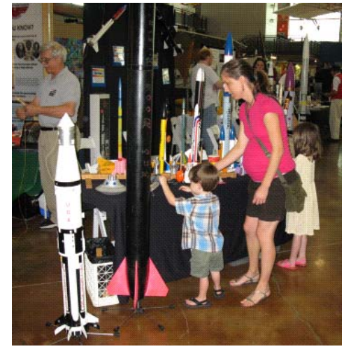
The DARS booth at the Moon Day Celebration.

On July 19, 2009 the Frontiers of Flight Museum at Love Field sponsored "Moon Day." The idea was to both honor the 40th anniversary of the Apollo 11 moon landing, and to encourage people to think about more aggressive space exploration in the future. The Frontiers of Flight Museum was a natural choice to sponsor such an event since it houses Apollo 7, among other moon related exhibits.