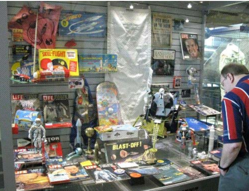
A really cool exhibit of vintage 50's and 60's space toys. Notice the "Tomorrowland" game in the middle, complete with Moonliner!