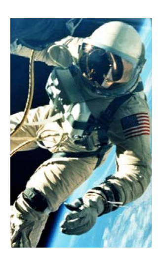
Stay connected! All of us will reach greater heights with your attendance at the club meetings.

Visit the DARS website for the meeting location: www.dars.org