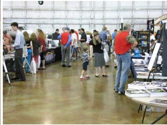
A couple of shots of the various booths at the event. The DARS booth was straight ahead and to the right.