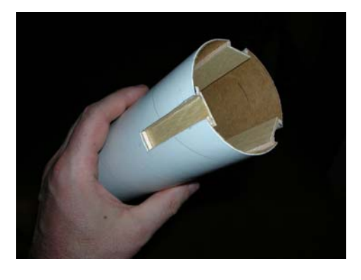
The landing gear boxes on the body tube.

make the landing gear boxes. The boxes on the lower body tube are separate from the ones on the