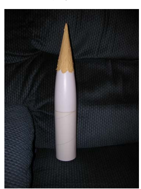
The nose with typing paper extension, covered with F&F.

I started with the nose cone. As I stated earlier, it was clear that the Estes cone was much too blunt. In order to get an idea of how pointed I needed to make it, I rolled up some typing paper into a cone and placed it on top of the Estes cone. I was surprised to find that the resulting cone was almost perfect in shape and size. I then rolled up some poster board to see if I could get the same effect with a sturdier medium. I couldn't. As it turns out, the poster board refused to roll tightly enough without crimping.