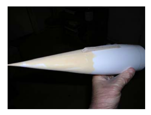
The cockpit under construction.

first thought about building it out of 1/32 inch plywood, but later thought it would be difficult to get the shape right. Therefore, I simply took a 3/8 inch square piece of balsa and cut it to shape.