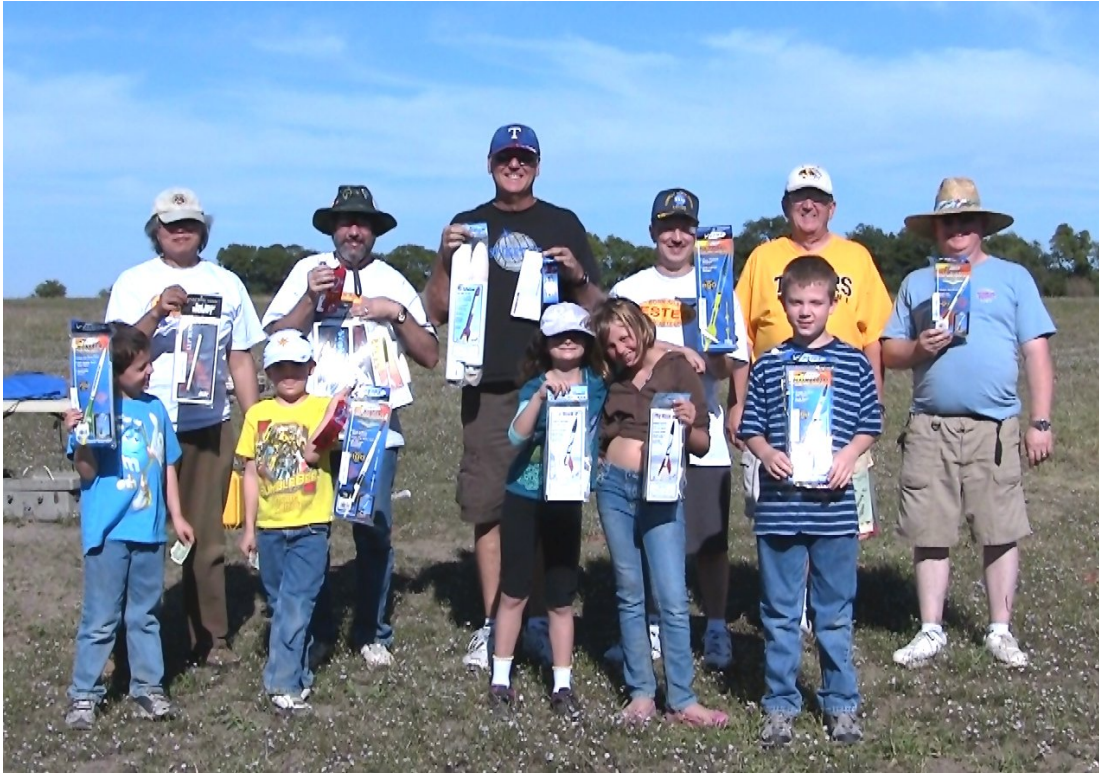
The DARS Fall Classic VI Winners with their prizes!