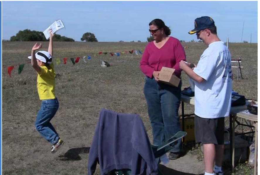
Some people got downright giddy when they won!