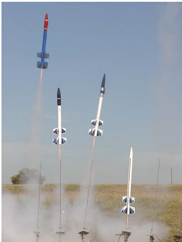
The Omegas take to the sky!